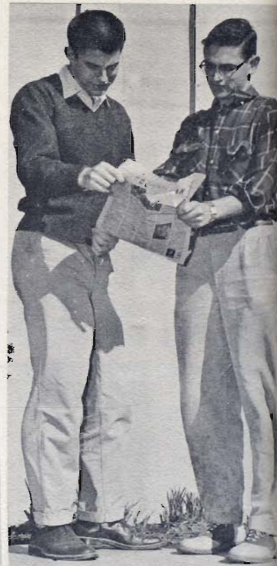
The 'wheels' were camera-caught debating over an article in The Collegian.

His plans for the future are somewhat uncertain but fall along the lines of political science and law. He plans to attend either Stanford University or University of California.