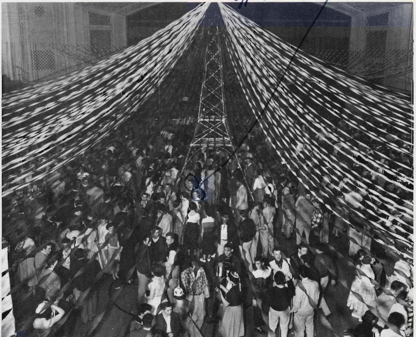
The decorations proved to be the center of attraction at the gay affair, with the glistening Eiffel Tower occupying the middle of the dance floor, taking all the honors for originality and craftsmanship.