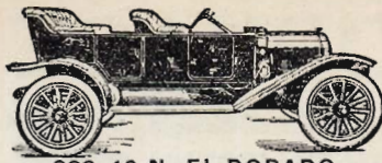
238-40 N. EL DORADO

You Can't Cover BUYING PUBLIC without proper representation in your City Directory the World with a postage stamp, nor can you cover the