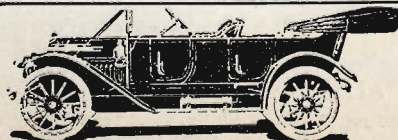
337 E LAFAYETTE

MASSACHUSETTS B & I CO Doo- little & Co Agts 39 N Sutter