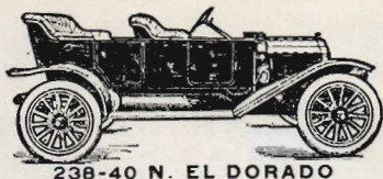
238-40 N. EL DORADO