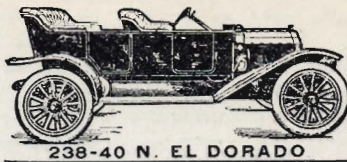
238-40 N. EL DORADO

BUYING PUBLIC without proper representation in your City Directory . . . . .