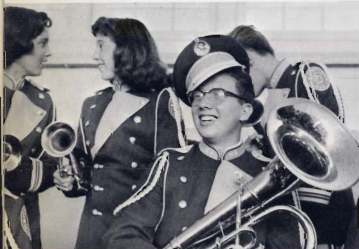
with the beginning of school, we prepare for our musical activities . . .