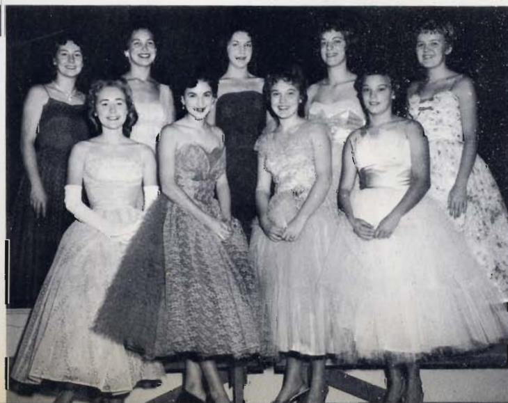
then we are caught up in the Homecoming Queen contest . . .