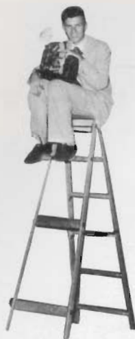
First, summer recreation program . . .