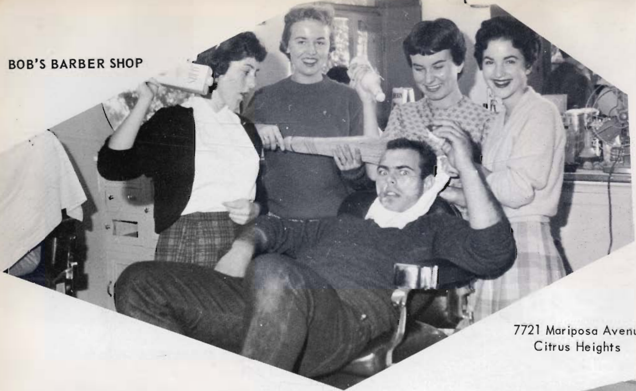
BOB'S BARBER SHOP