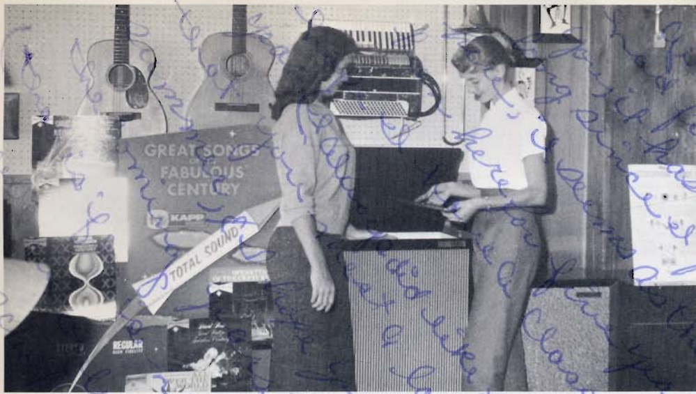
JACK'S HOUSE OF MUSIC 2528 Yorktown Avenue Sacramento