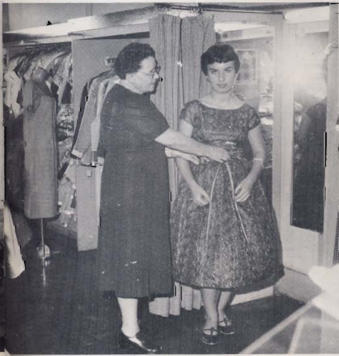
JUDY'S APPAREL SHOP 243 Vernon Street Roseville