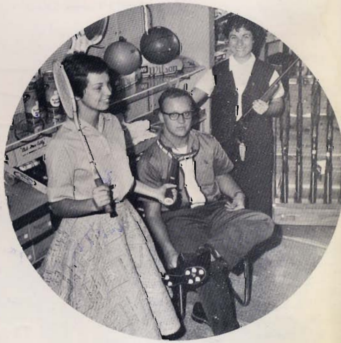
WOLF & ROYER HARDWARE & SPORTING GOODS 229 Vernon Street Roseville