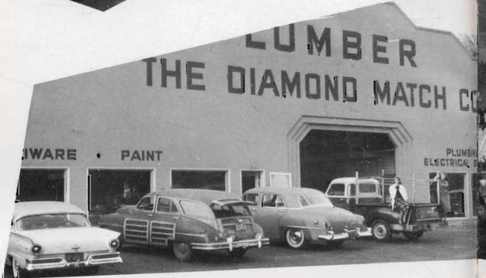
DIAMOND GARDNER CORPORATION Fair Oaks Boulevard Fair Oaks