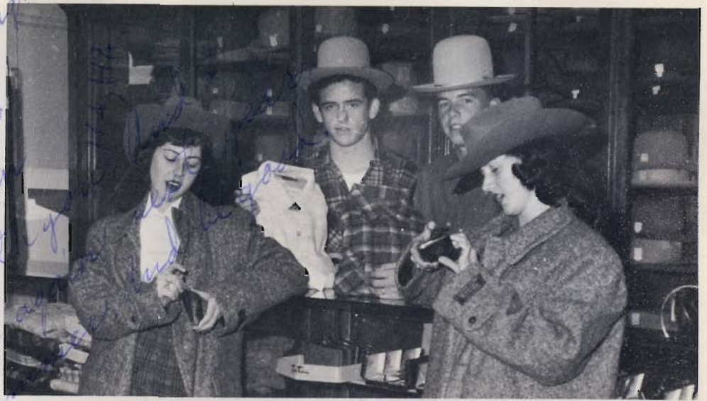
RICHARDSON'S Men's & Boys' Furnishings & Shoes 209 Vernon Street Roseville