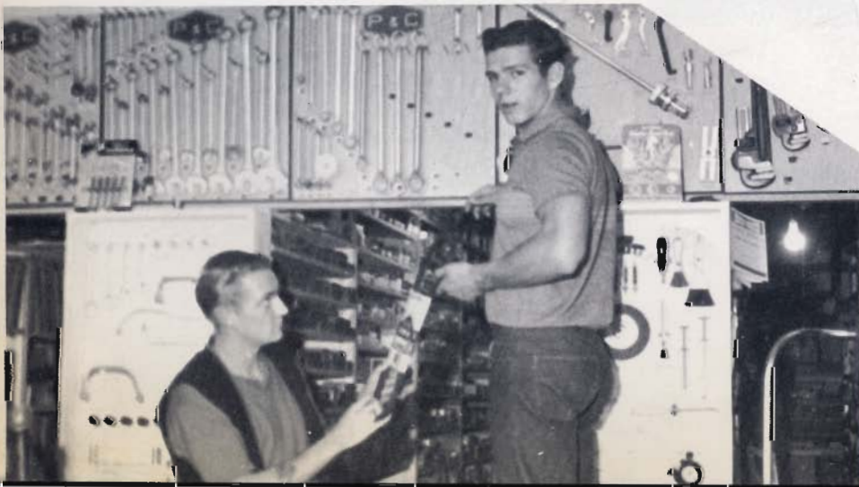
EVANS AUTO SUPPLY 328 Riverside Avenue Roseville