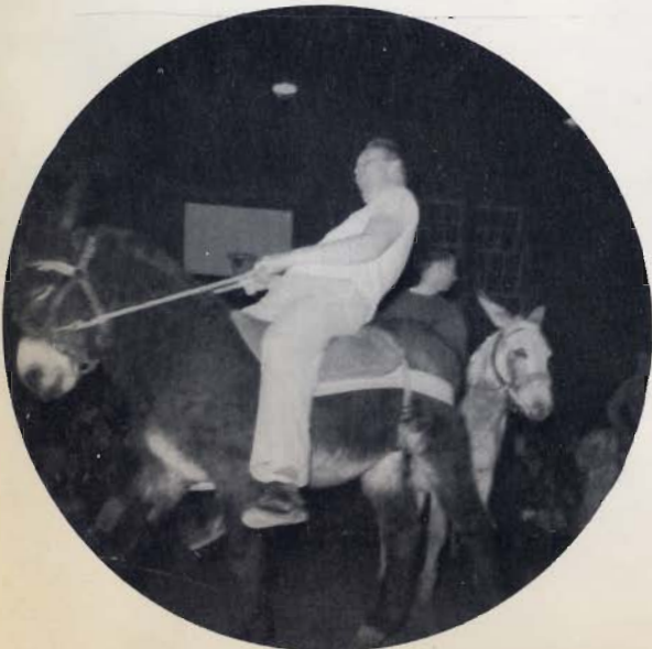
WHO'S THE STUBBORNEST!!