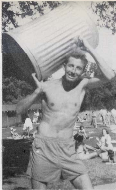
Can Hadacol Cure This?!