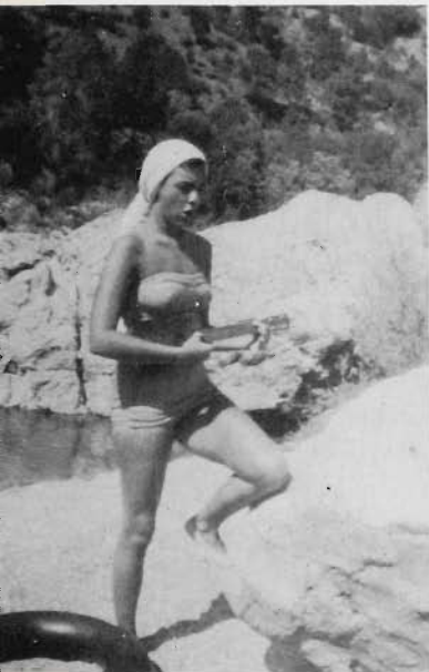
She Can Sing Too!