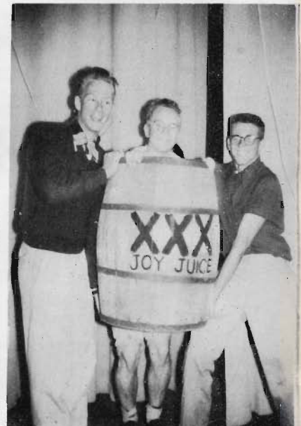
Seen My Pants?!