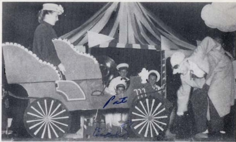
Band members took part in the Gay Nineties Program.