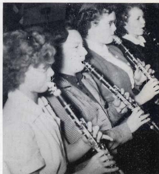
Even at practice the band looked good