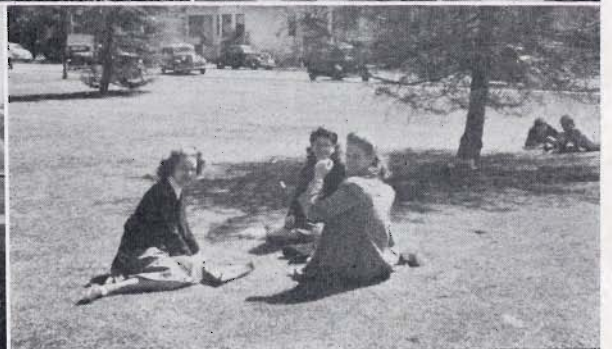
Nice lookin' team!