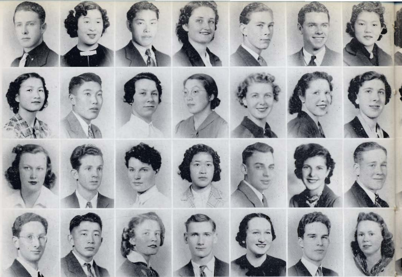
SURPLUS SUZUKI SWAN SWEET