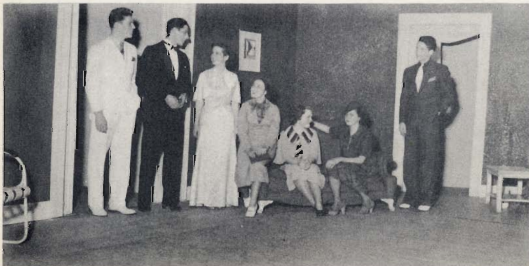
Left: Cast of "Newspaper Bride"