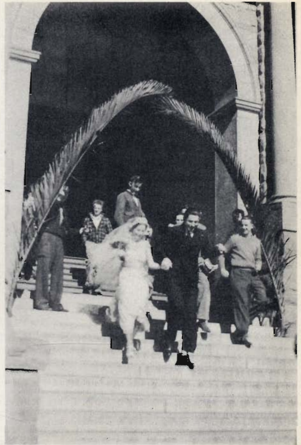
Above: Stunt Advertising February Senior Play