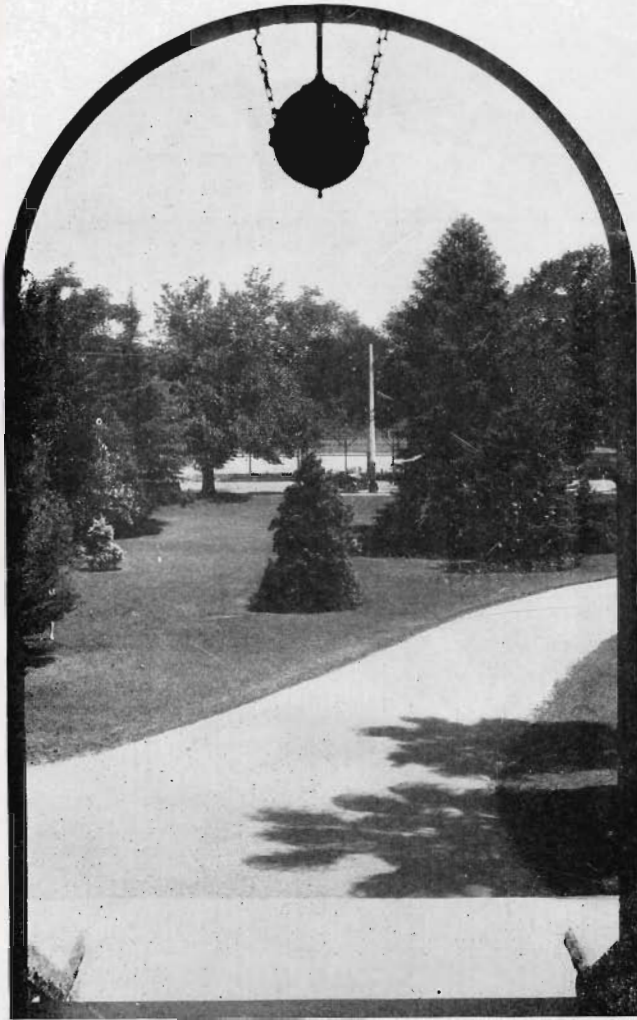
Looking Through the East Doorway Into the Glade