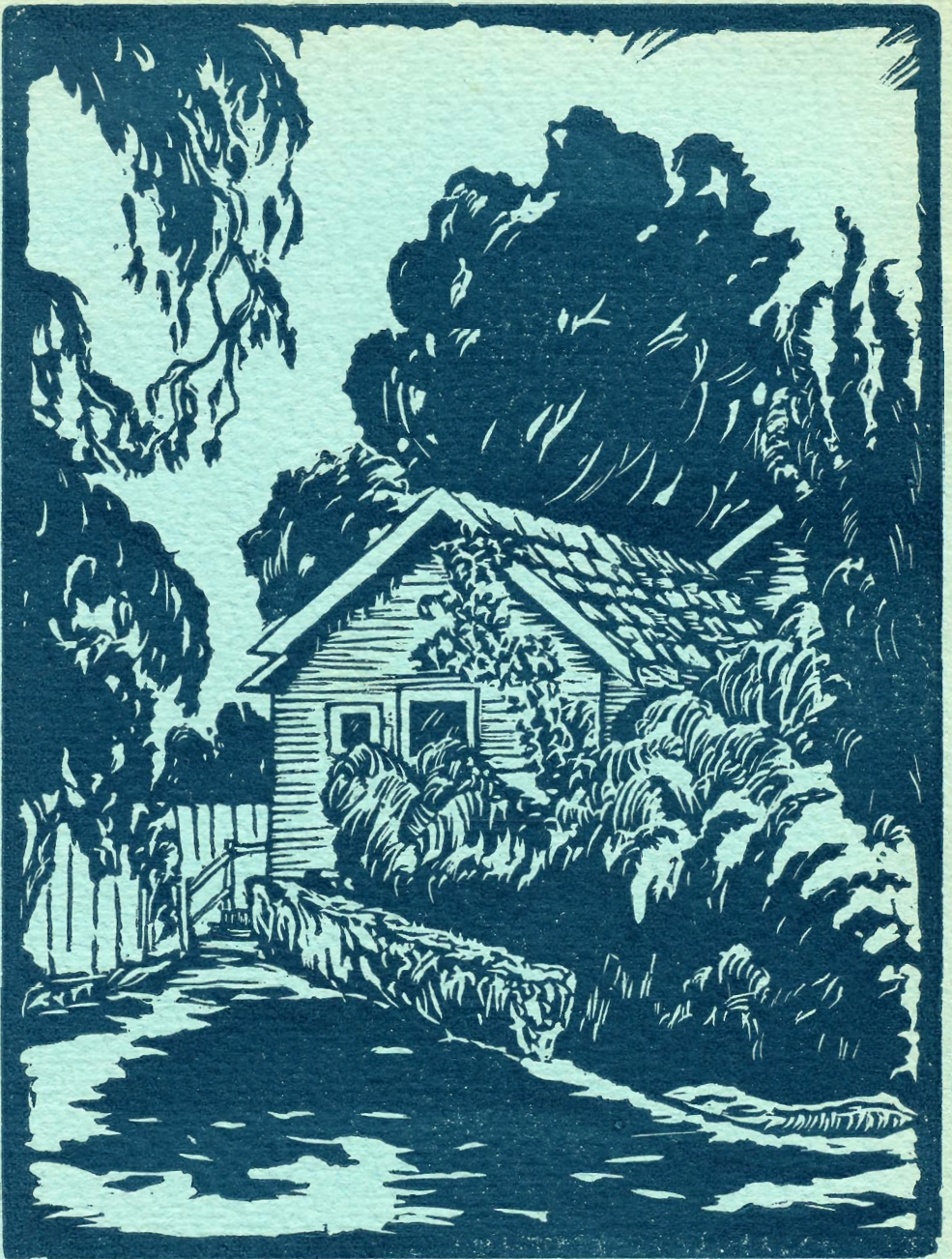
BUNGALOW FRED WRIGHT