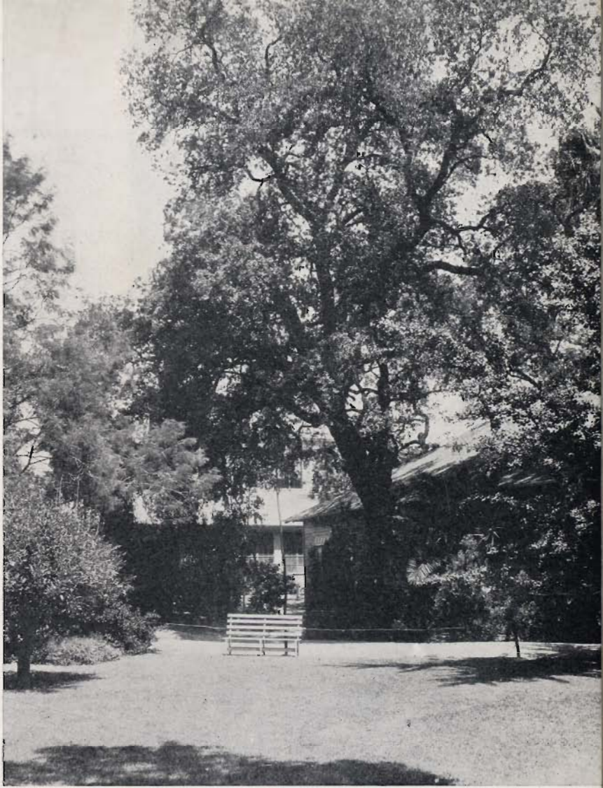
"Monarch Oak . . . The Patriarch of Trees"