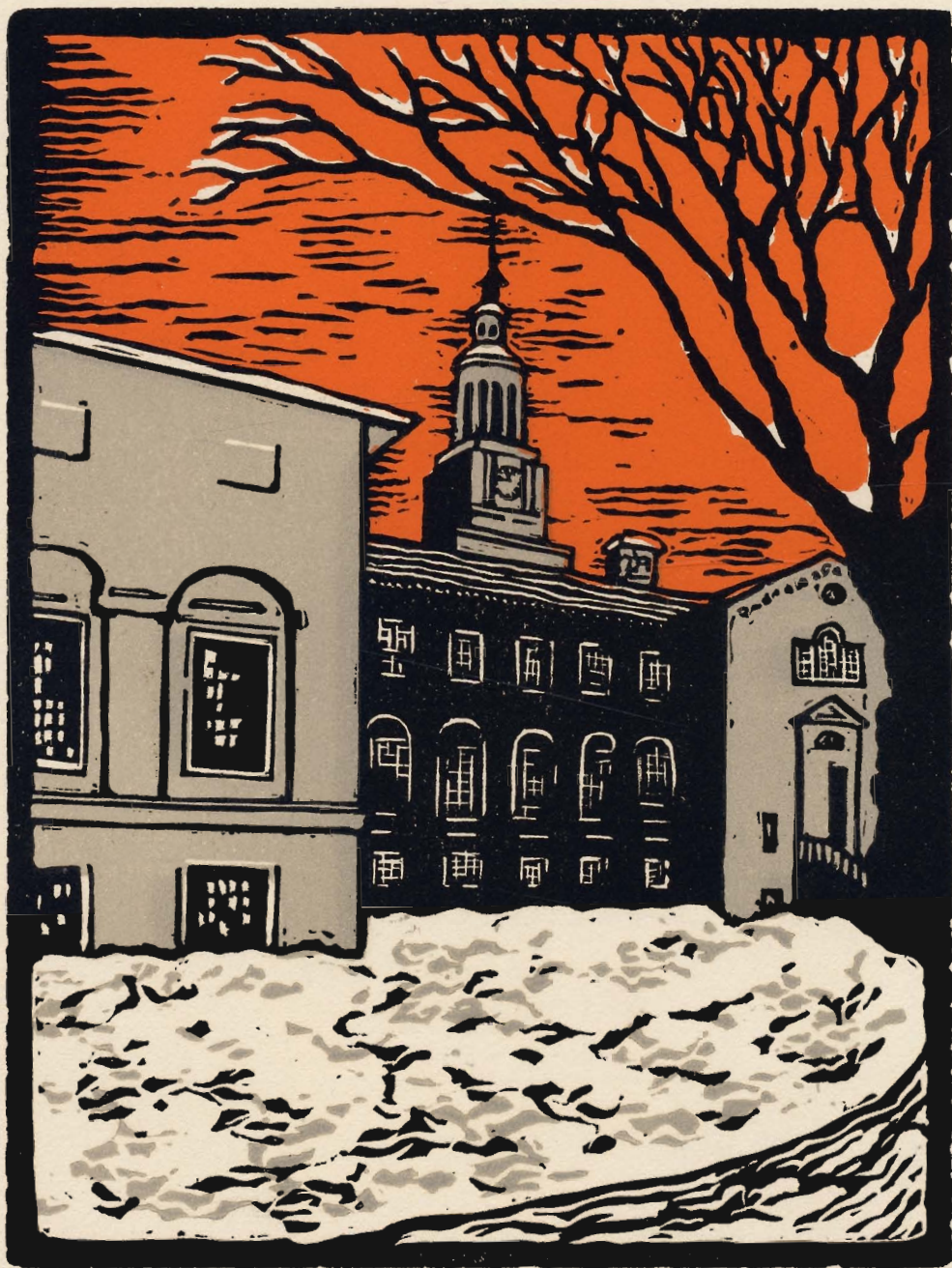
BAKER MEMORIAL LIBRARY HANOVER, NEW HAMPSHIRE