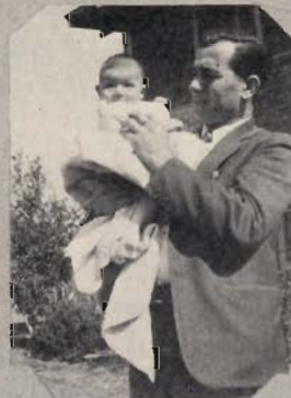
PAPÀ AND THE BABY