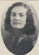
Madeline S. Jory Academic