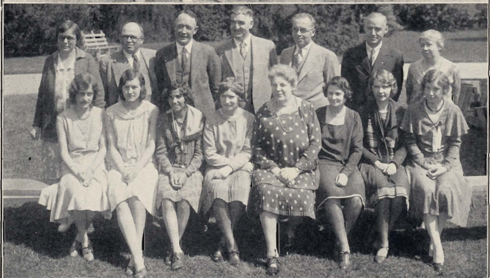
Top: English and Mathematics Teachers Middle: Vocational and Physical Education Teachers Bottom: Administrative