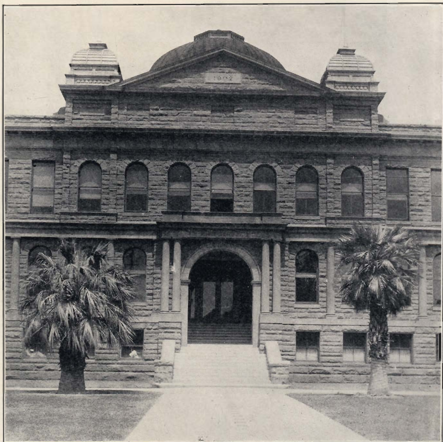
Where Many Nations Meet and Learn