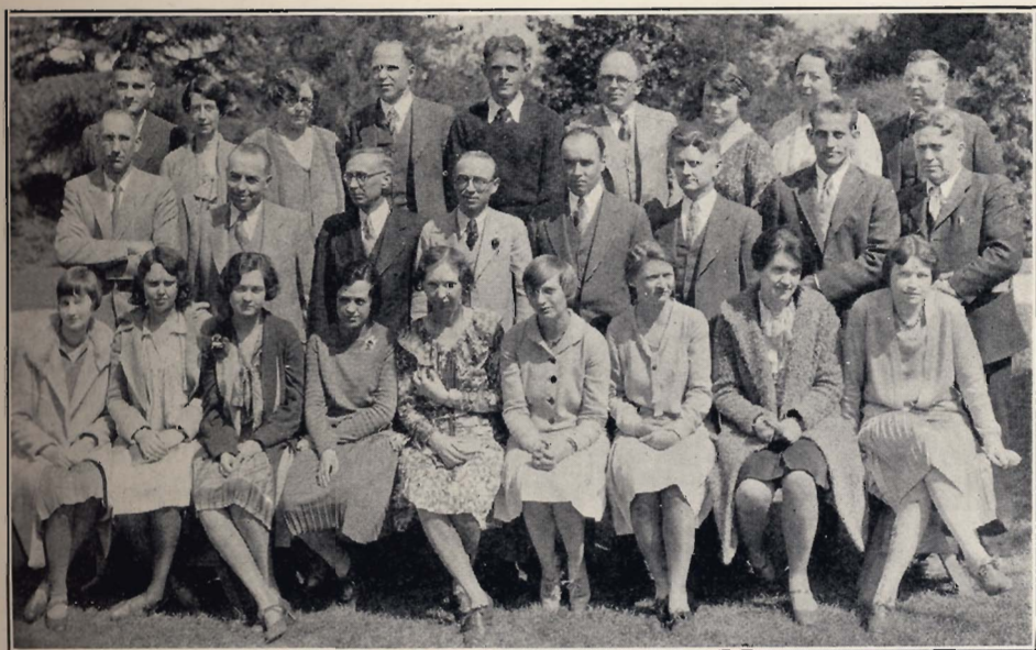
Social Science, Commercial and Home Economics Teachers