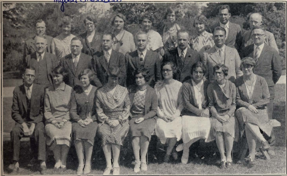
Language, Science, Art and Music Teachers