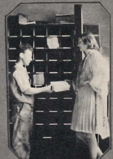
"The Gats, please."