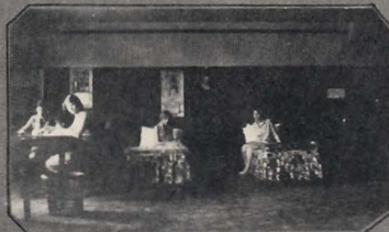
"Time to Retire"