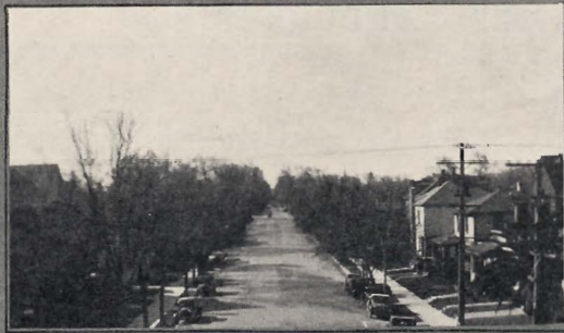
Looking down Sutter Street