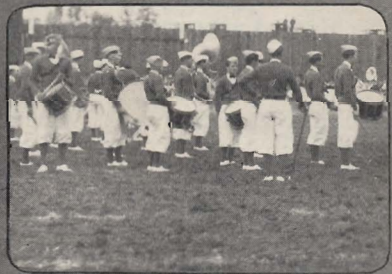
The Band in Action