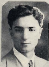
Ernest Landucci Vocational