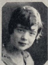
Margaret Spooner Academic Honor Scholarship six quarters; Secretary-treasurer Student Body '28; Student Control '27-'28; Sophomore debate '25; Latin play '25; S. B. Waterman prize '24; Chairman finance committee Girls' Association