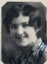
Kenneth Littleton Academic Honor Scholarship one quarter.