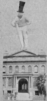
"Brick" in action