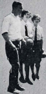
What's Wrong Don?