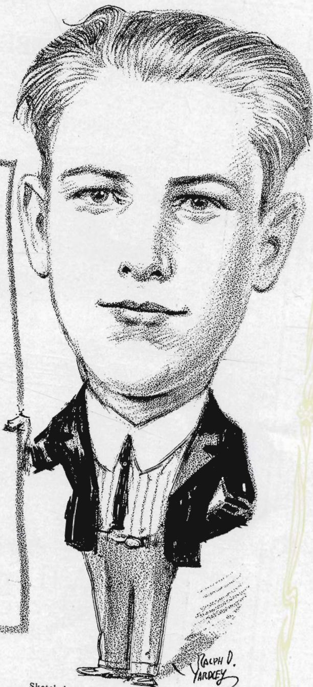
Sketch by courtesy of Ralph O. Yardley