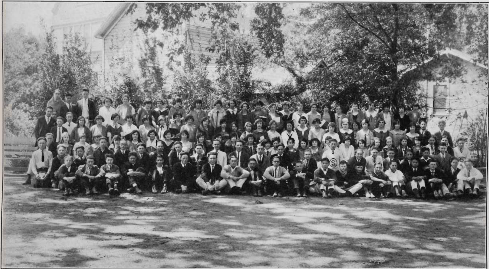
10B SOPHOMORE CLASS