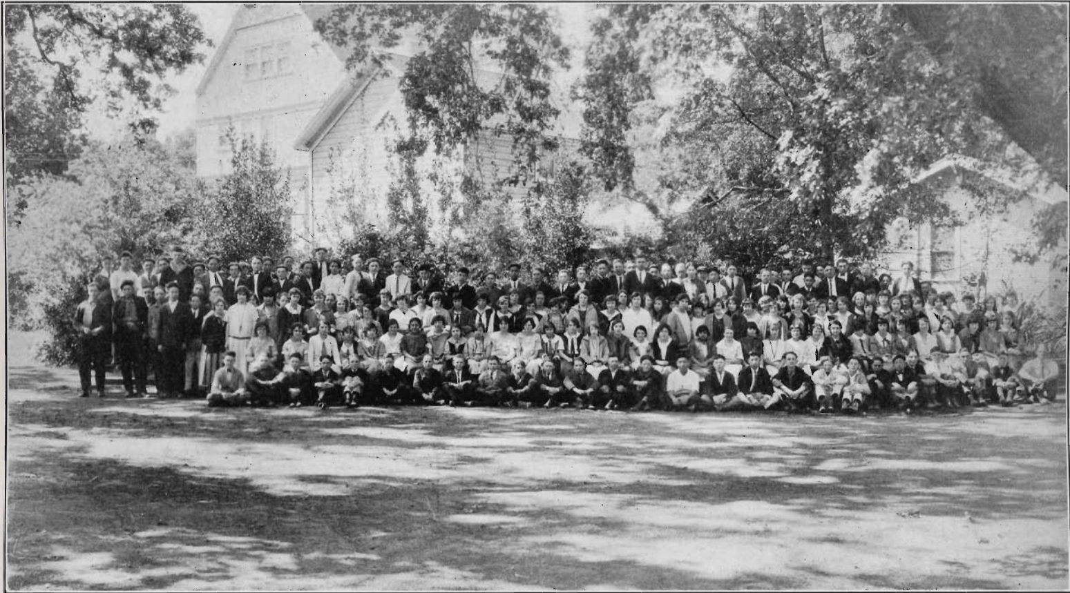
9B FRESHMAN CLASS