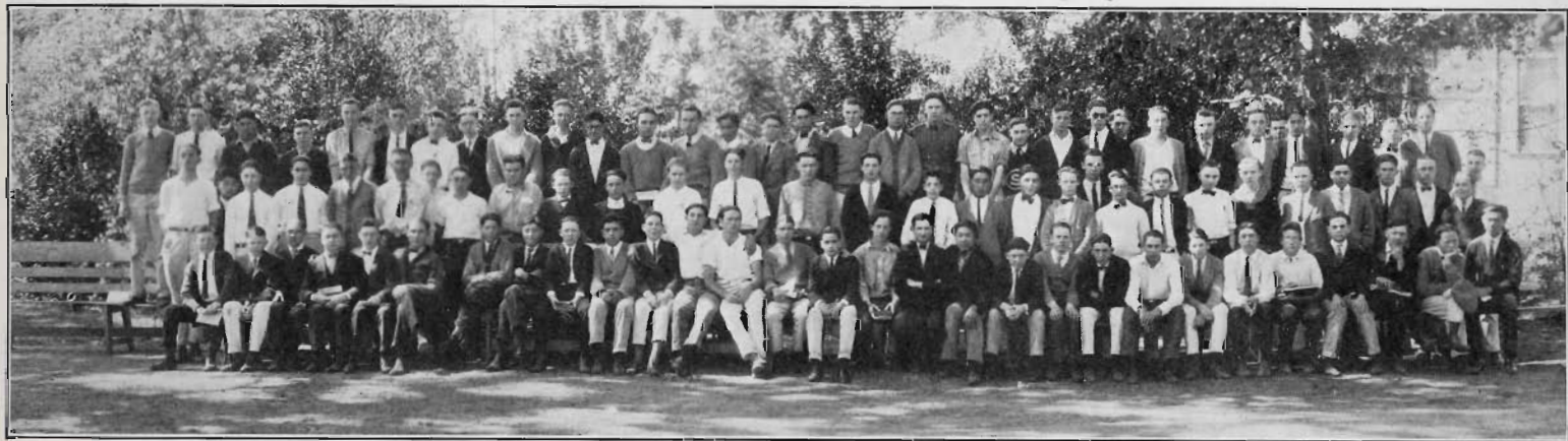
10A SOPHOMORE BOYS