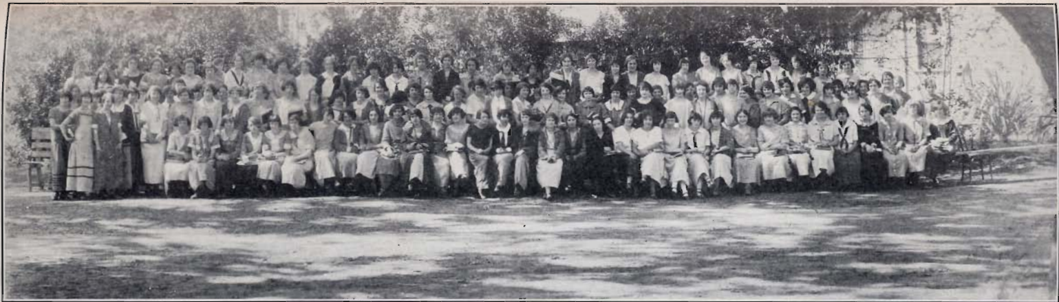
10A SOPHOMORE GIRLS