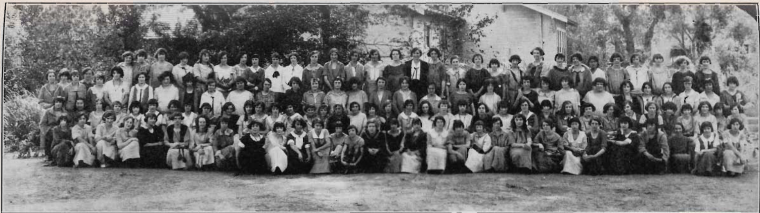
9A FRESHMAN GIRLS