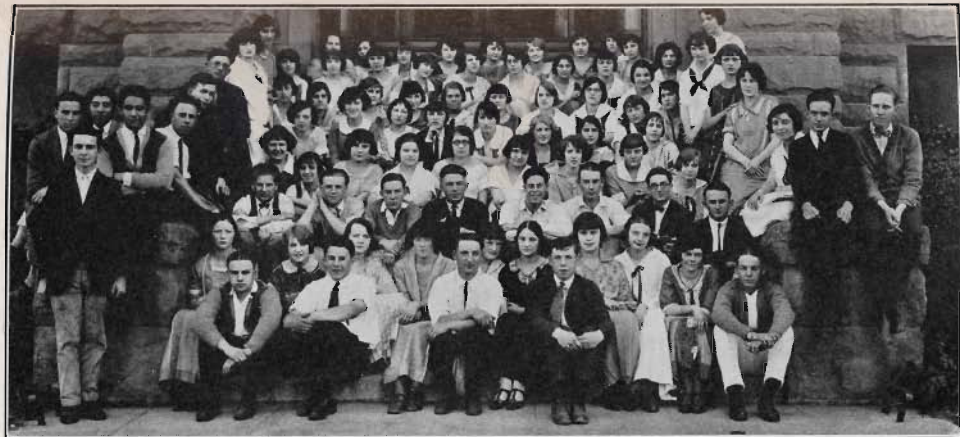
11A JUNIOR CLASS