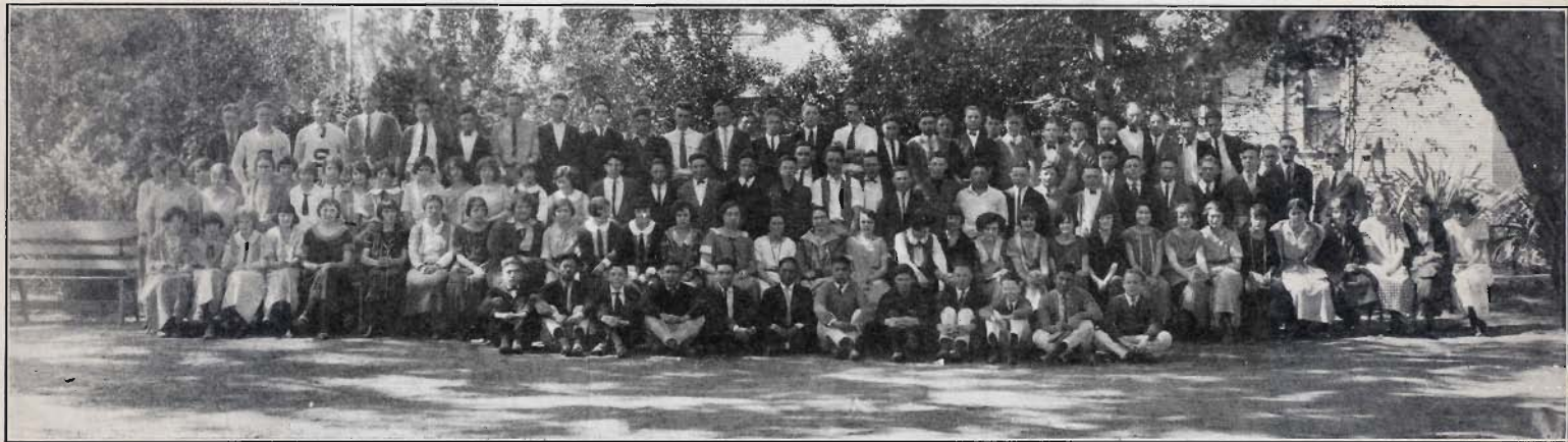
11B JUNIOR CLASS