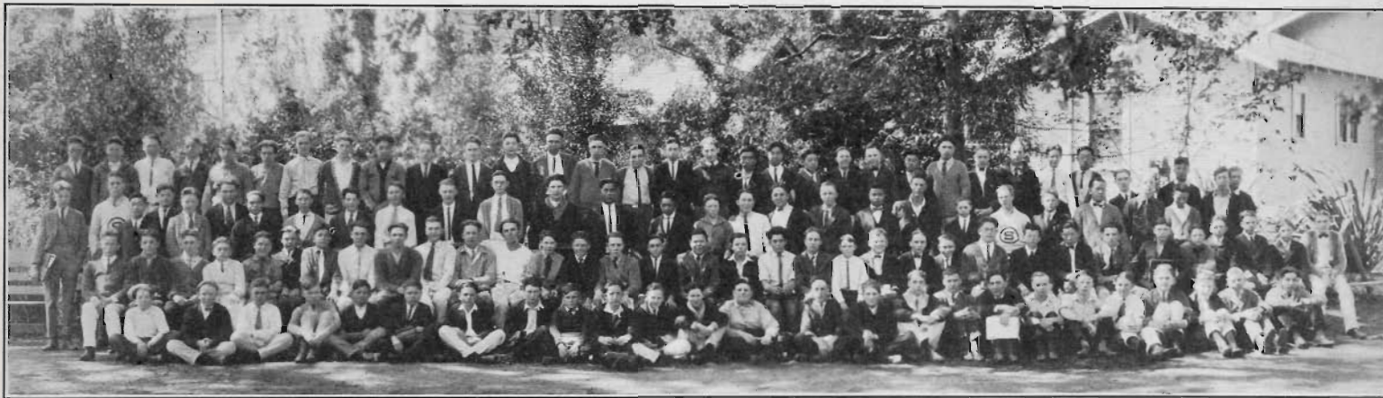
9A FRESHMAN BOYS