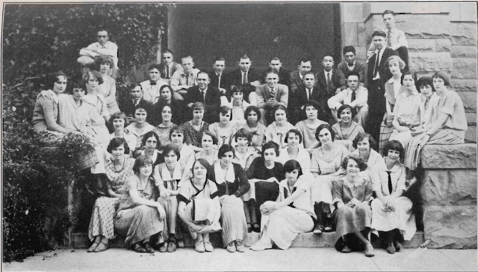
1271 12B SENIOR CLASS