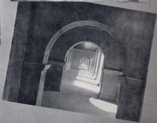
Views of Stockton High School