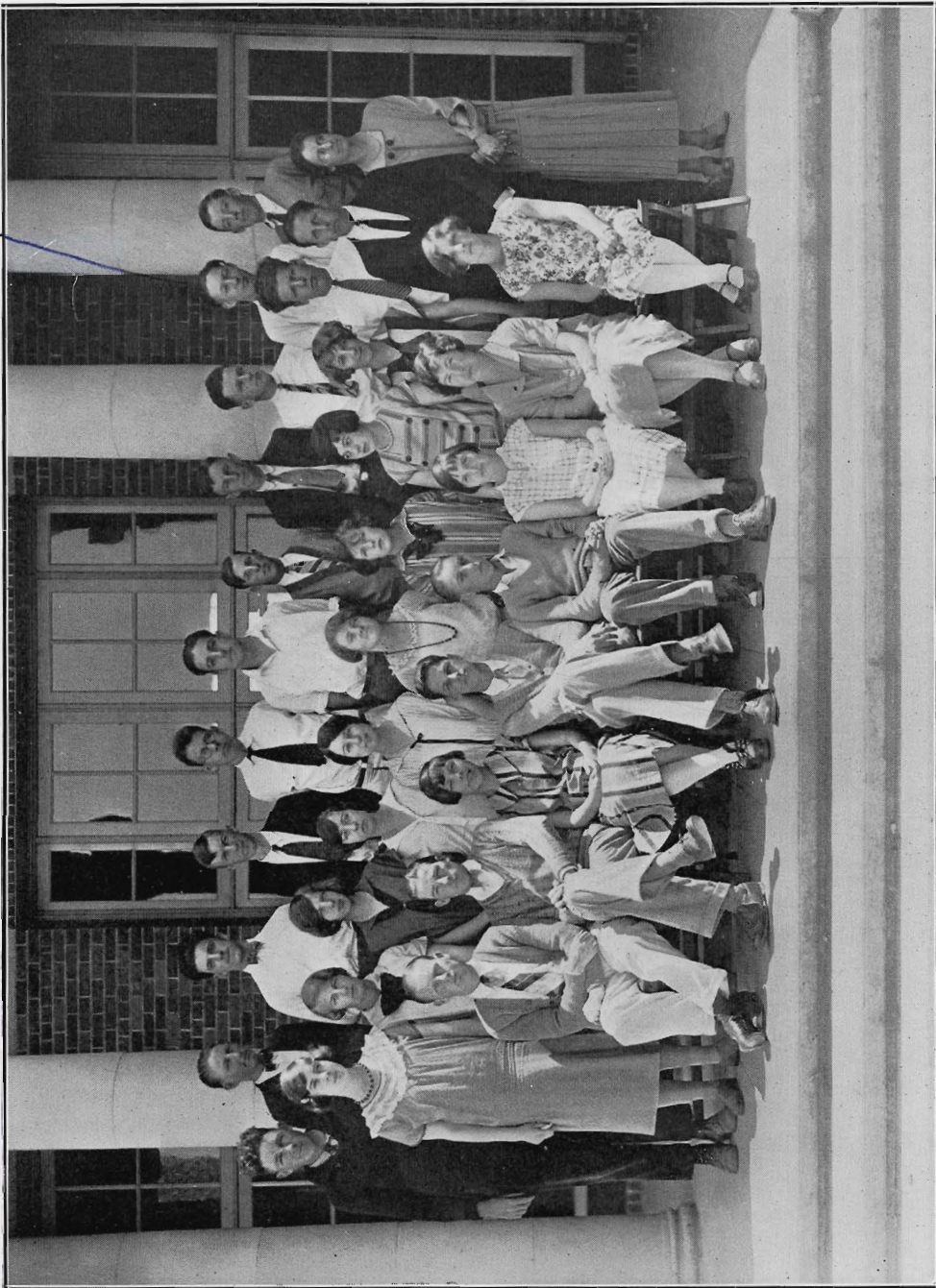
MATHEMATICS HONOR SOCIETY