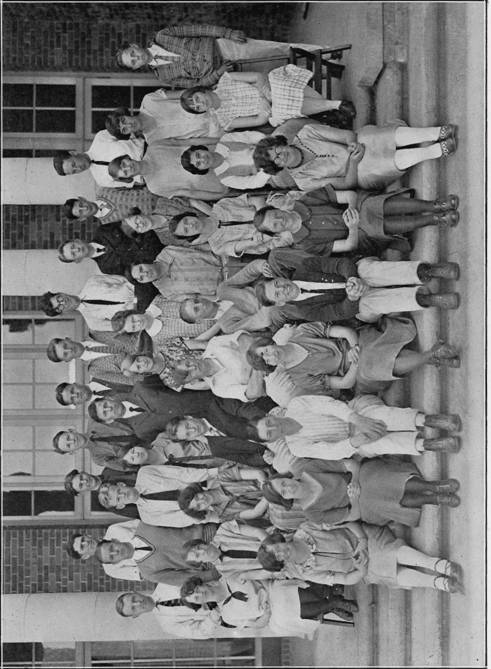
ROSTRA DEBATING SOCIETY