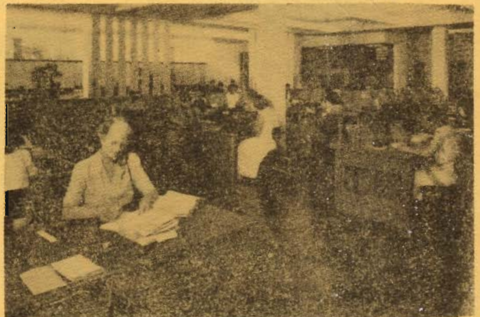
SECTION OF CREDIT BUREAU