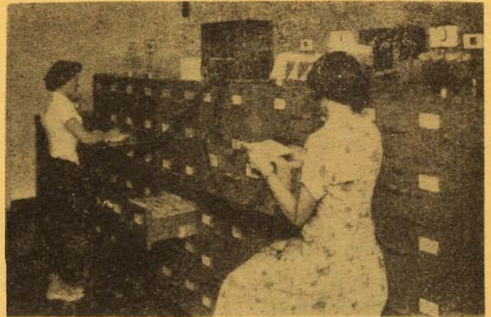
SECTION OF CREDIT BUREAU