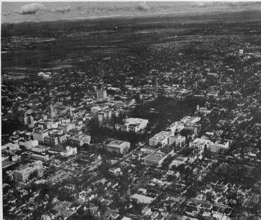
Aerial View of California State Capitol

Sacramento is the banking center of interior California, served by seven strong banking institutions.