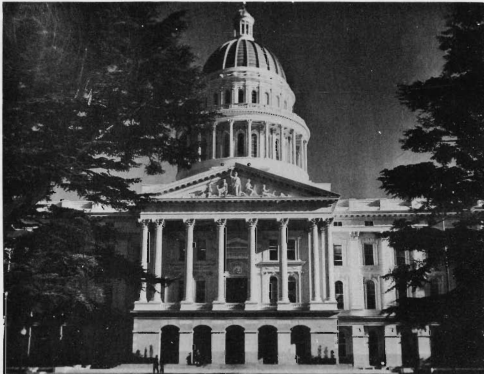
California State Capitol Building

Railroads—4: Southern Pacific, Western Pacific, Sacramento Northern, Central California Traction.