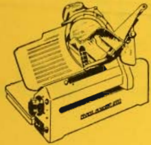
America's Finest Slicer