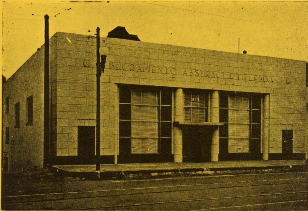
MAIN OFFICE BUILDING