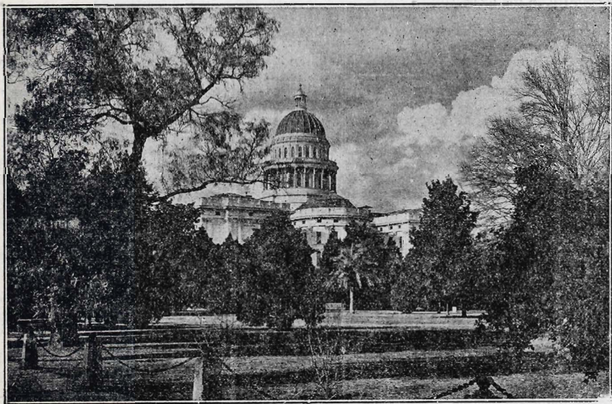
STATE CAPITOL BUILDING