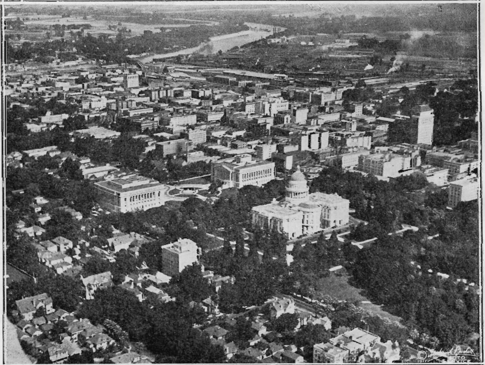
AERIAL VIEW OF STATE CAPITOL

“To the Man Who Wants to Keep Happily Active”