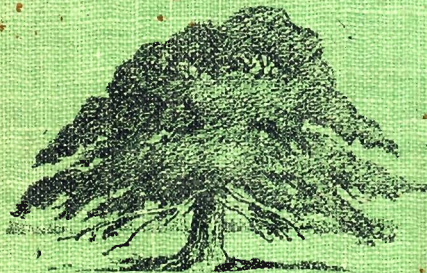
As Sturdy As An Oak

Homes and Apartments Built to Stand the Test of Time and With the Desire to Please