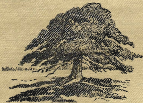
As Sturdy As An Oak