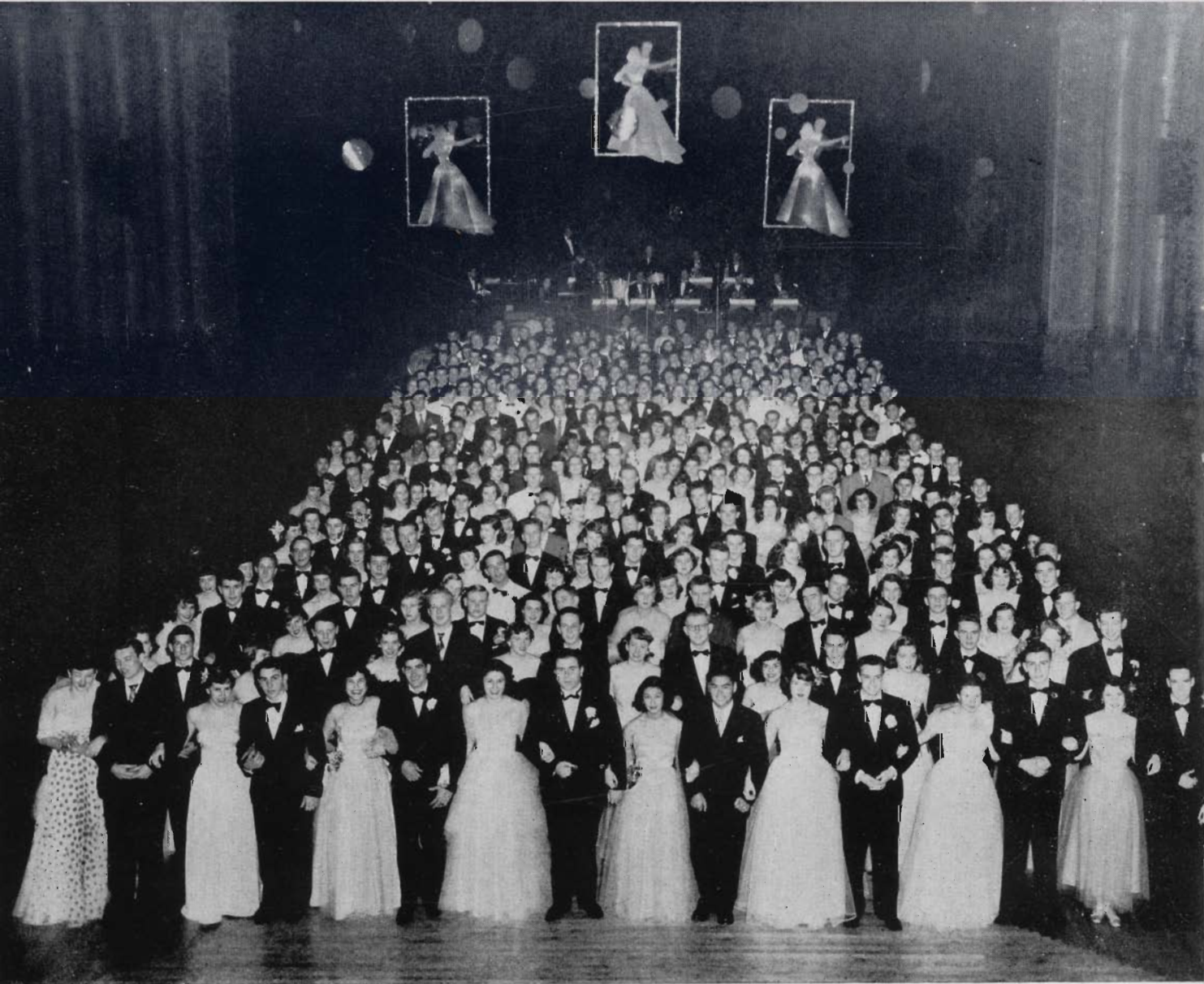
Top left—The Committee Chairmen: