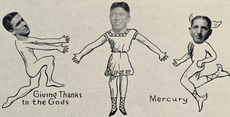
Giving Thanks to the Gods