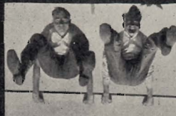
Up or Down