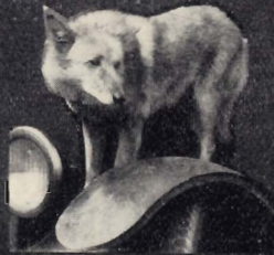
A Lone Wolf