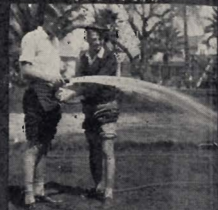
Don't Get Wet