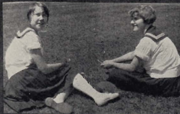
Taking it Easy