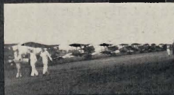
"THE AIR CIRCUS"