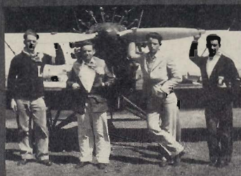
The Air-minded Four