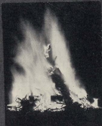
Who's On Top?