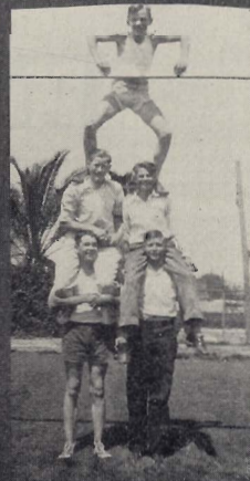
FeeWee On Top