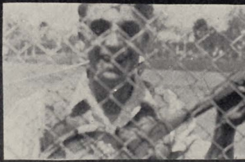
In The Cage-