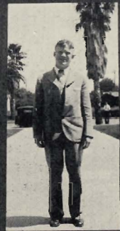
DROPPED FROM THE SKY