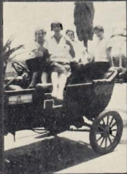
A CAN OF PEACHES