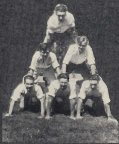
Don't Fa Down