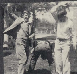
THRU THE MILL