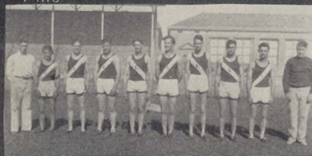
On To Chico