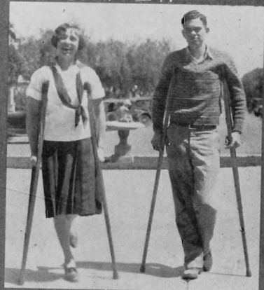
WE NEED SYMPATHY