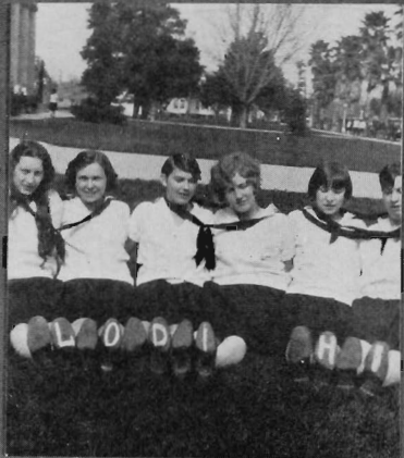
THAT'S THE WAY WE SPELL IT.