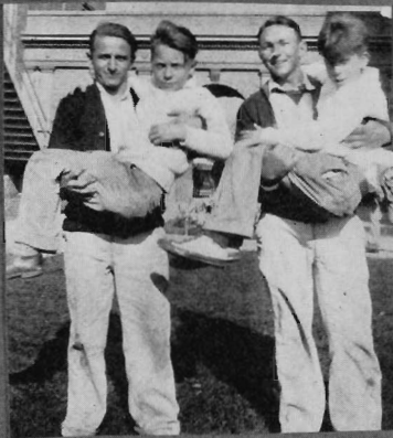
INFANTS IN ARMS