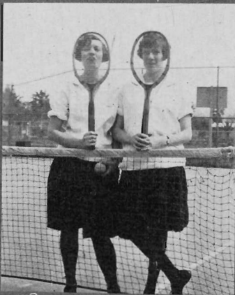
SCENE THRU A RACKET