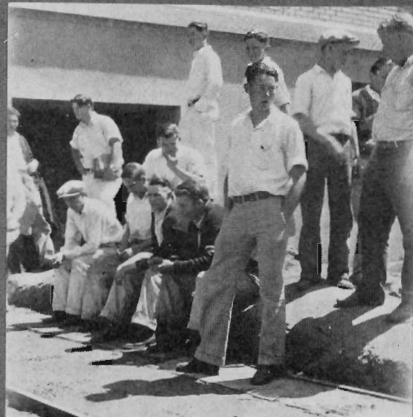
THE HANG OUT.