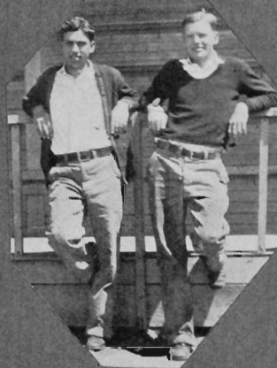
GIV'M THE AX