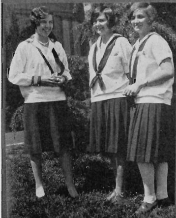
TWO BEAS AND A VIOLET