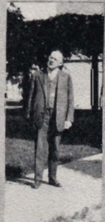
Yes or no?