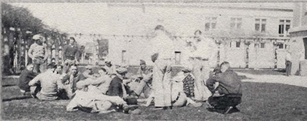
The Noon Hodge Podge