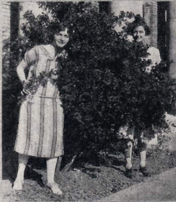
Hide and seek