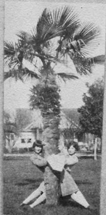
If the tree should fall