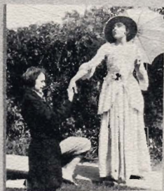
On bended knee.