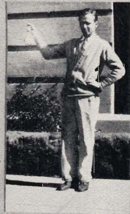
The glow of gold