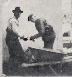
Keeping at it.