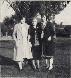
Why so sad?