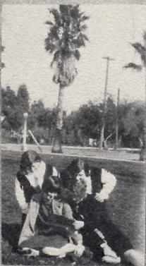
Almost a monkey pile