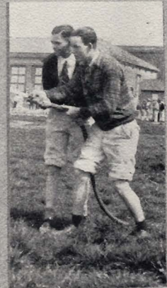
Children will play