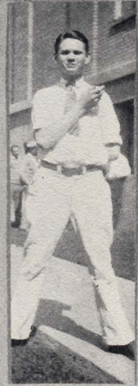
I'm the guy