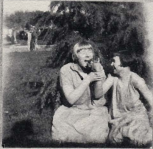
A big bite