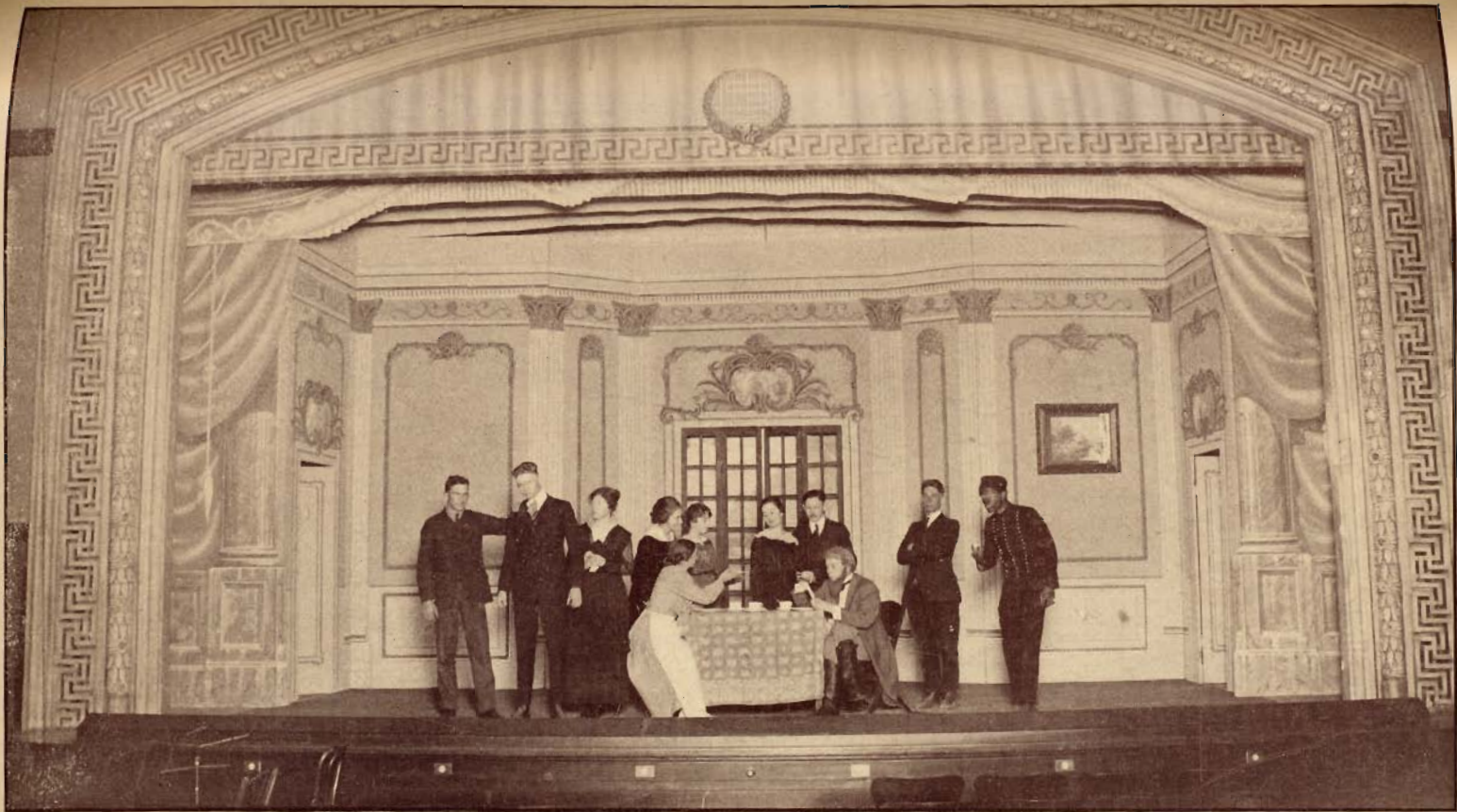
The Junior Play, "Diamonds and Hearts."