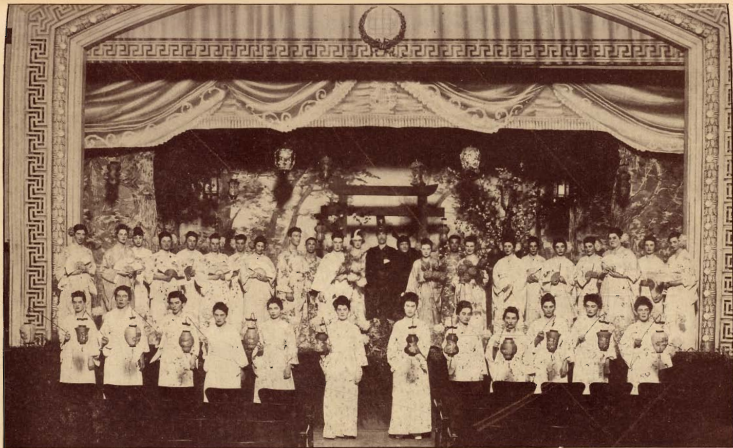
The Senior Operetta "The Princess Chrysanthemum."