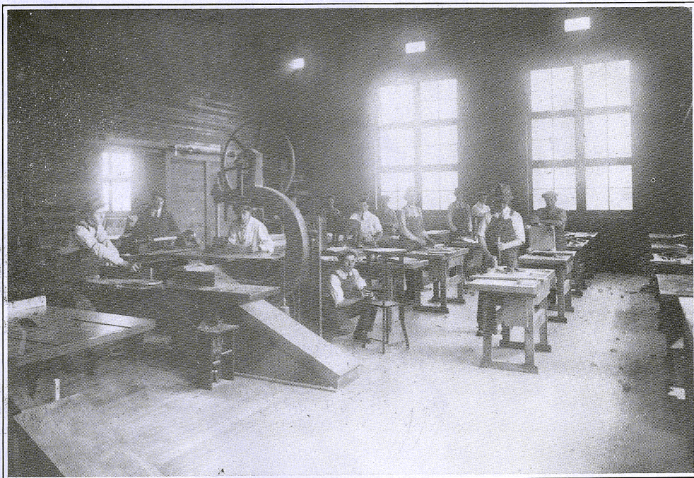
MANUAL TRAINING DEPARTMENT SHOP