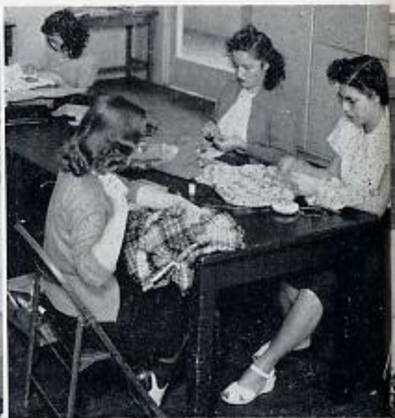
HOMEMAKERS AT WORK—