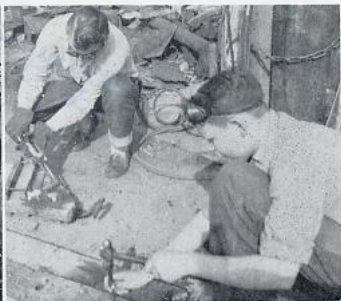
AUTO SHOP FELLAS PUT 'EM TOGETHER—