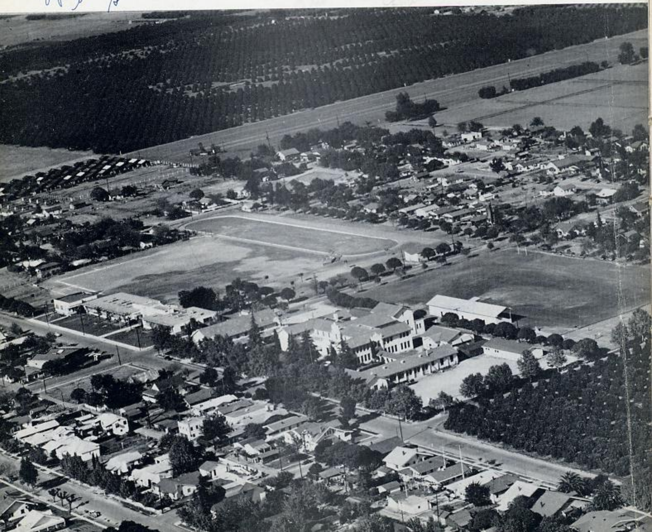
Airplane view of Lindsay High's campus.