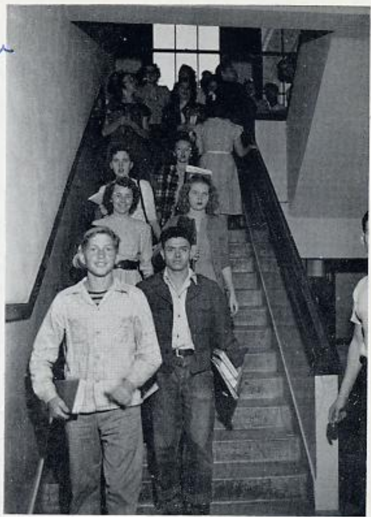
Below: The noon hours were joyfully spent resting on the lawn.