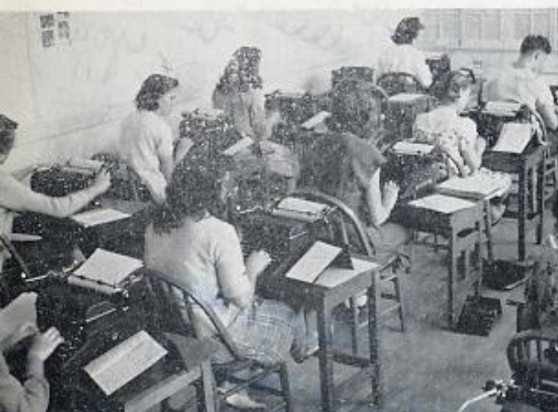
TYPISTS AT WORK—