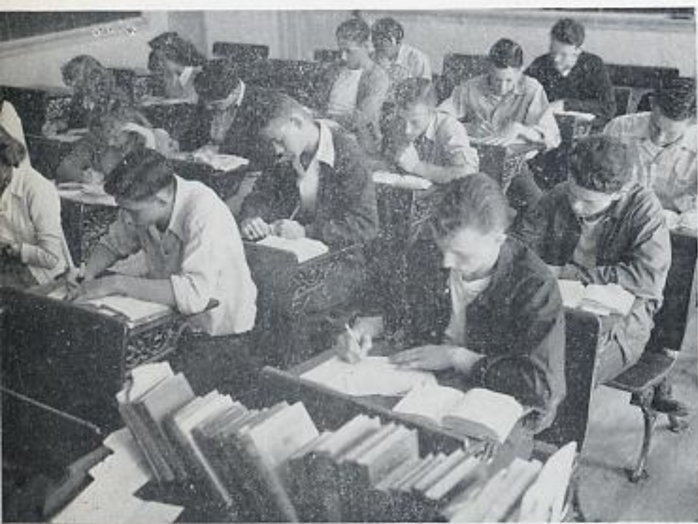
THOSE STUDIOUS ALGEBRA II STUDENTS—