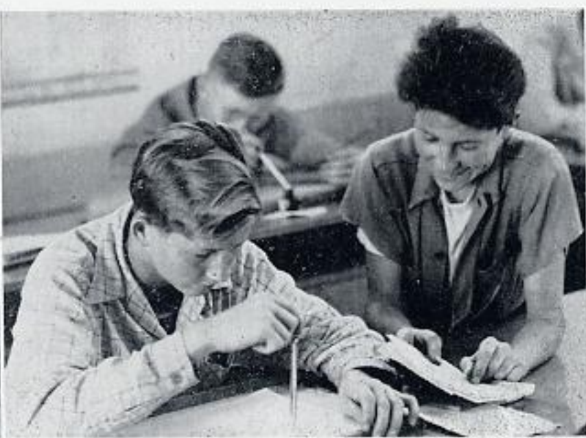
MECHANICAL DRAWING CLASS WAS SOMETHING—