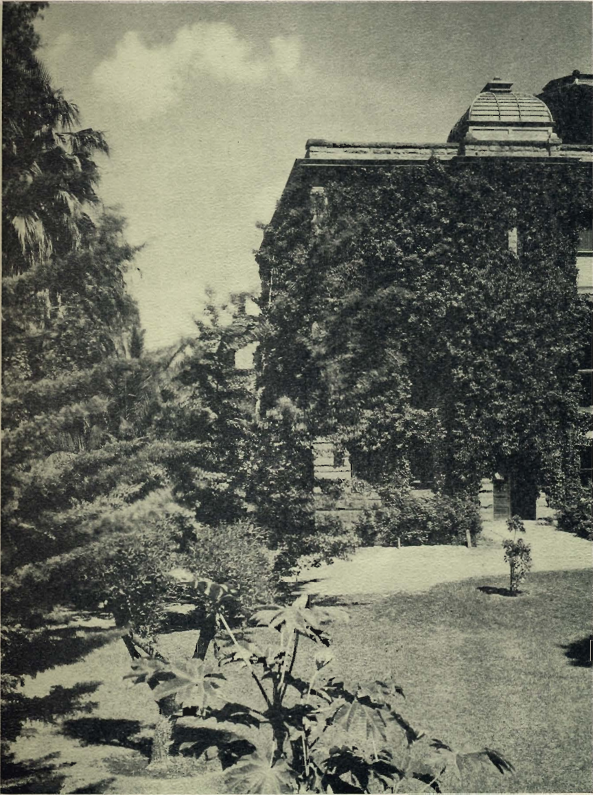
REAR WING, ACADEMIC And ivy thy wall with its mantle entwine