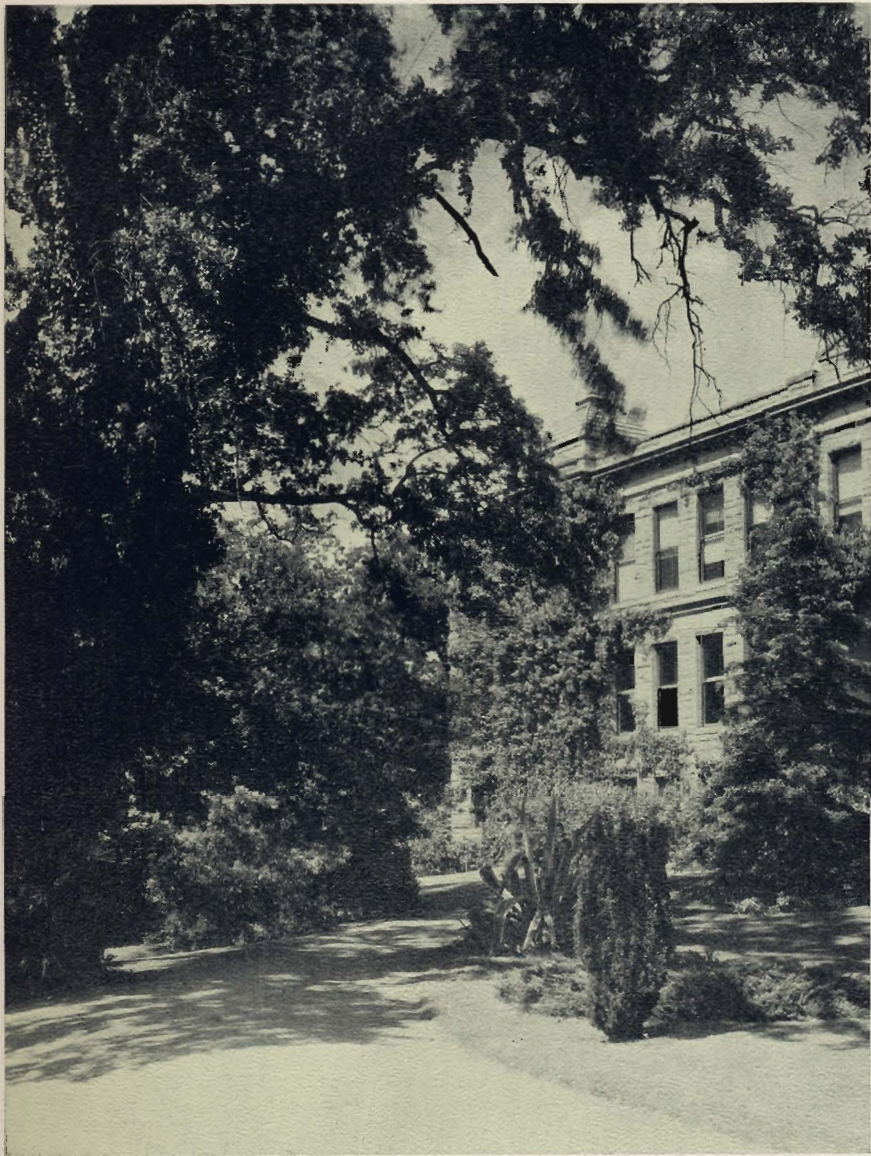
WEST ACADEMIC BUILDING As close as oak and ivy stand