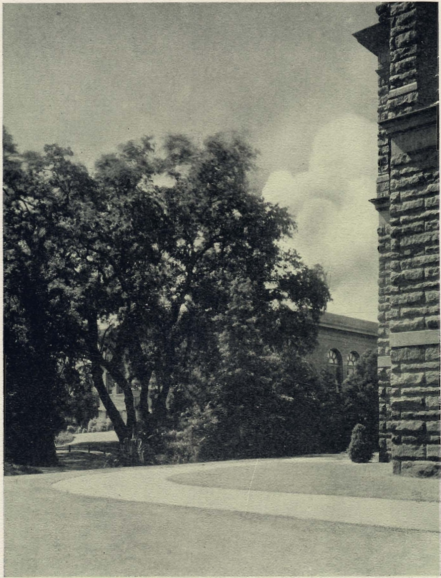
THE CAMPUS, WEST Rich beauty oft abounds in mere simplicity