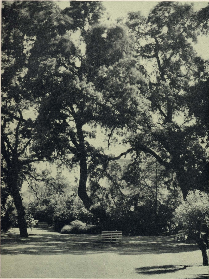
OAKS IN THE GLADE Sunshine patching the gray-green oaks