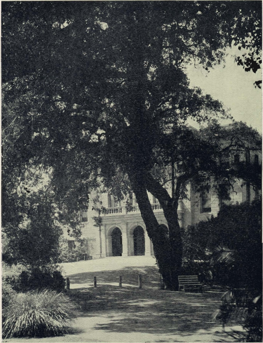
AUDITORIUM Under the cooling shadows of a stately oak