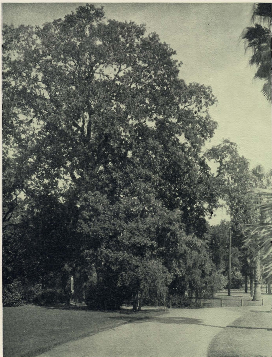
MEMORIAL OAK Monarch oak, the patriarch of the trees