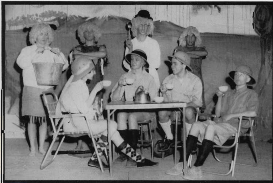
THE NATIVES ARE RESTLESS TONIGHT