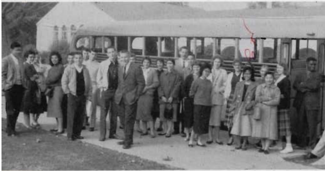
Council officers joined leaders of Franklin and Stagg High Schools for a meeting of the National Association of Student Councils in November.