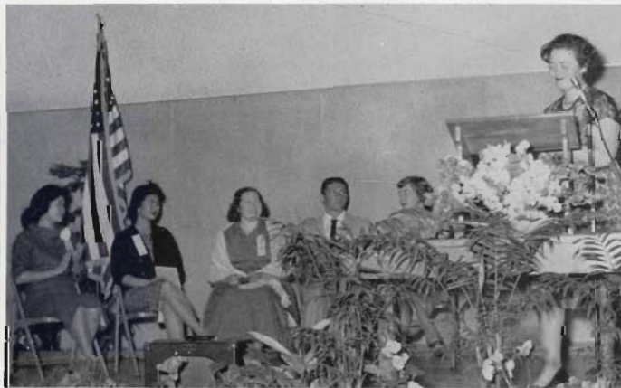
STATE JUNIOR CLASSICAL LEAGUE OFFICERS