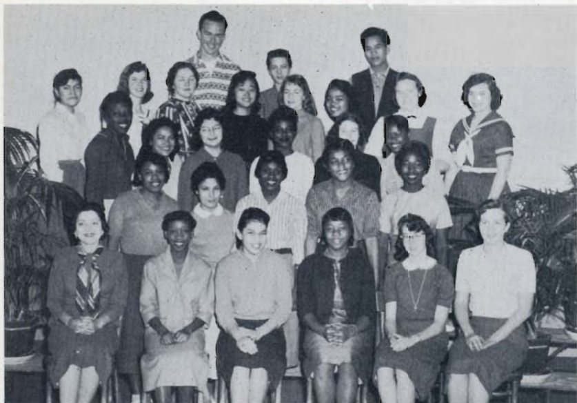
SOUTHSIDE LIONS' CLUB SPEECH AWARD