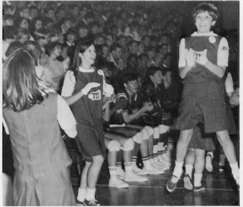
That's what Lions call spirit.