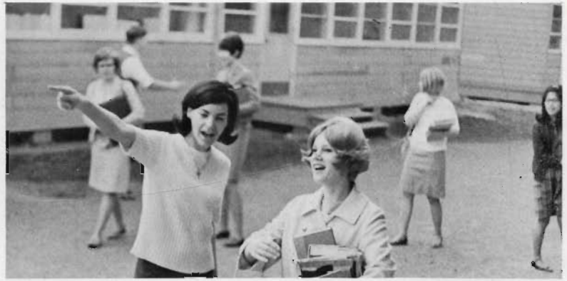
. . . There's the Boys' Gym.