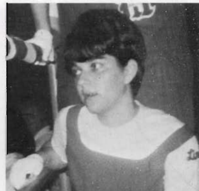
"Please make one more."