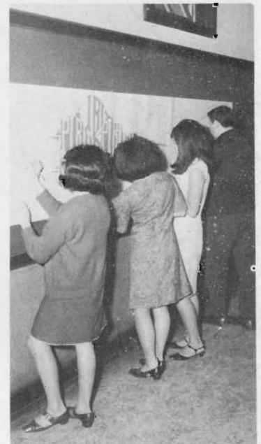
Lions display creative spirit.