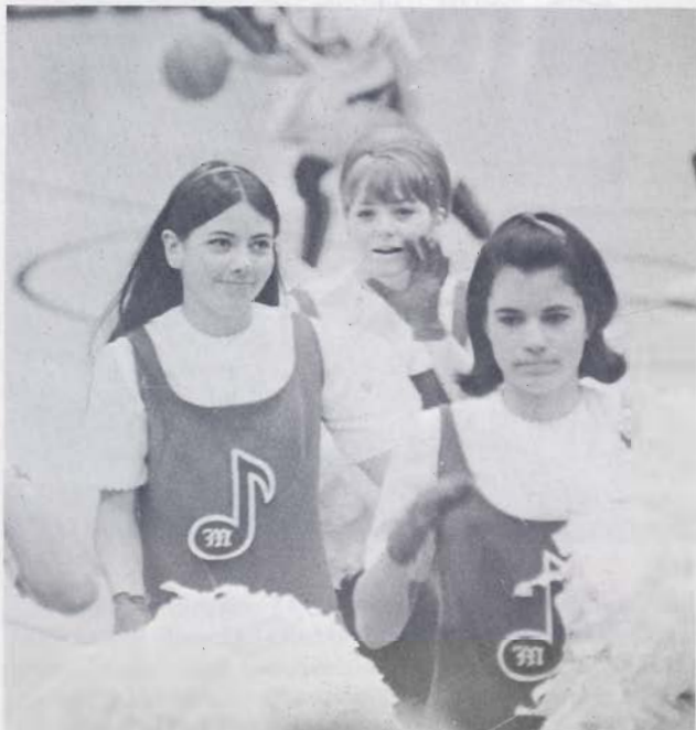
"You win some, you lose some."