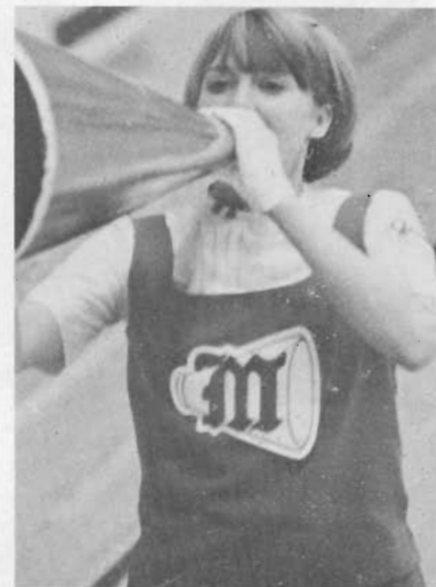
"Hey Joe, Johnson High says it can't be done!"