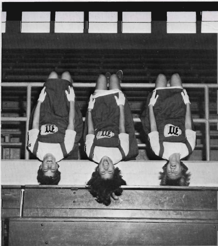
"... but when you're up against McClatchy you're upside down!"