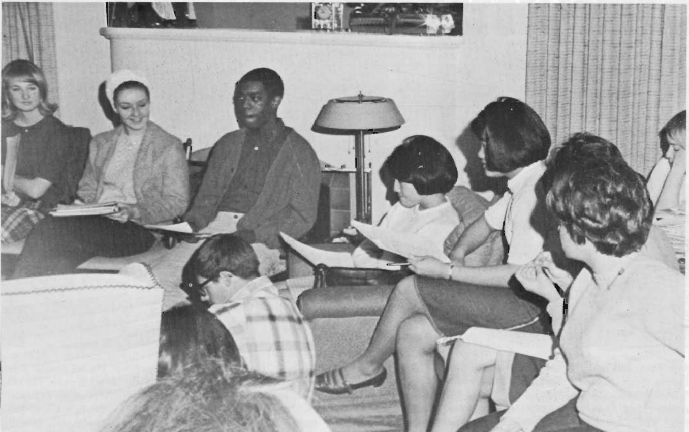
Board of Directors talks over old business and plans for new activities.

If you kick me in the knee once more, so help me . . .