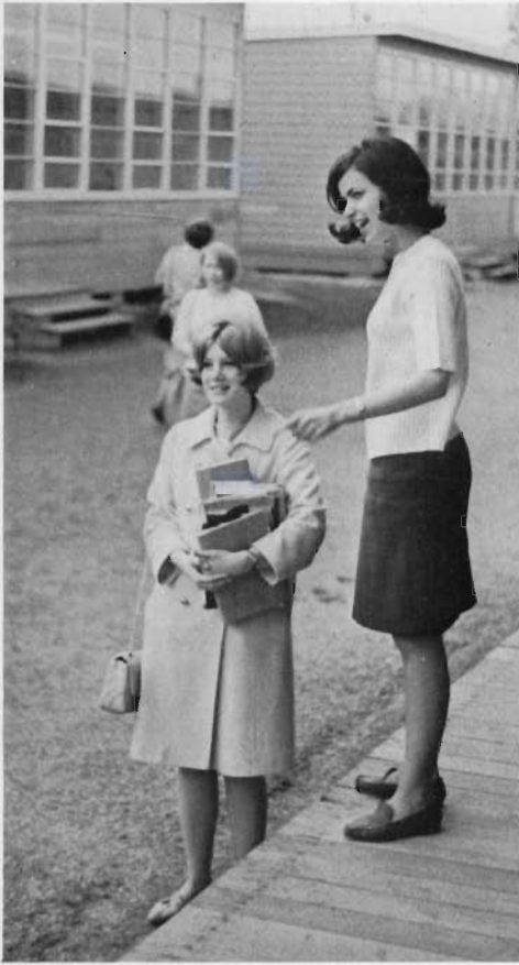
Places of interest? Well . . .