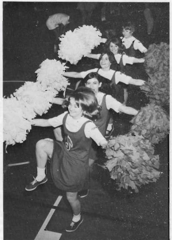
"What a keen way to do the Can-Can!"