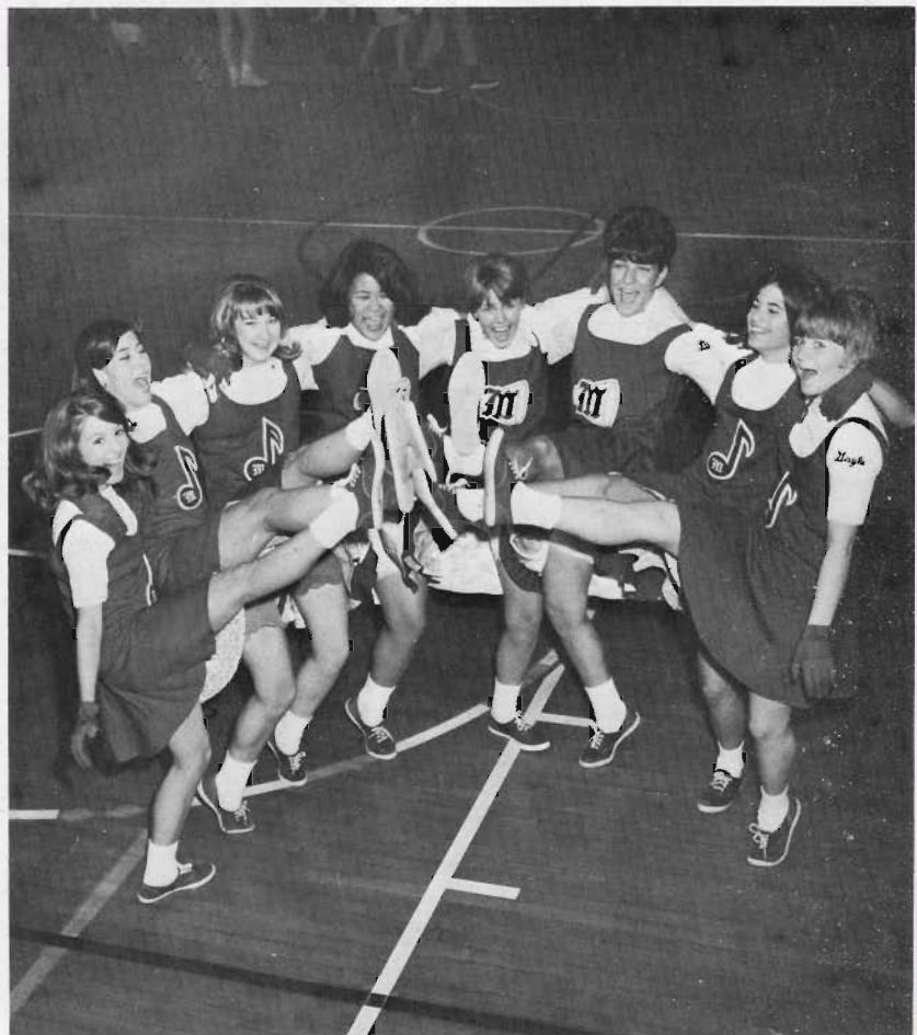
McClatchy shows off eight feet of its award winning spirit.