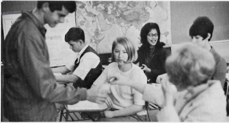
Service takes from the rich . . .