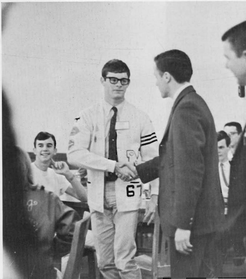
He's slipping him the money now.