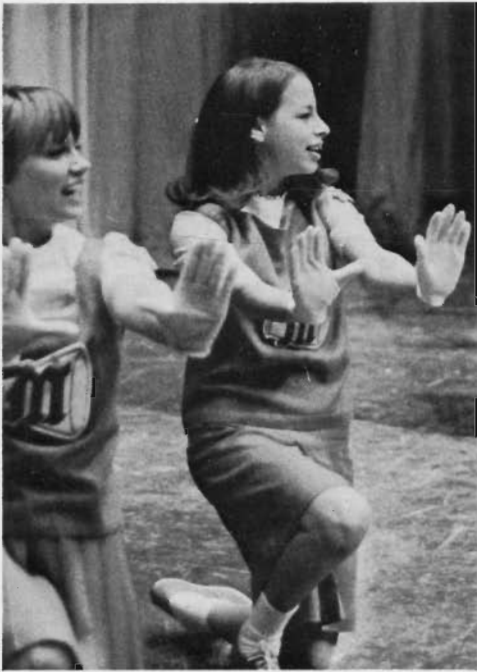
"Push 'em back!"