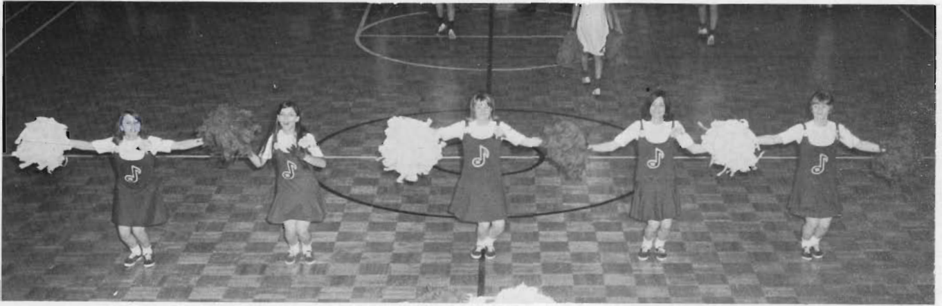
"Who me? I never forget anything."