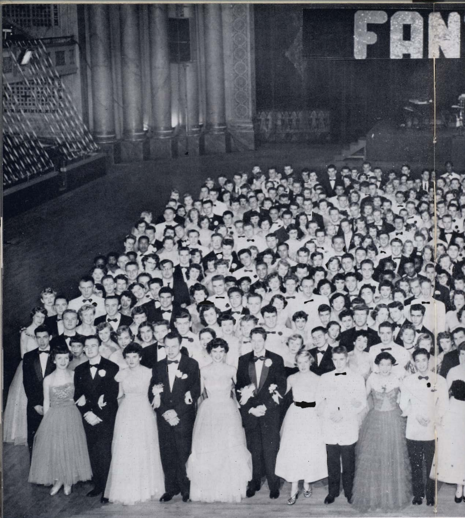
This Year's Senior Ball