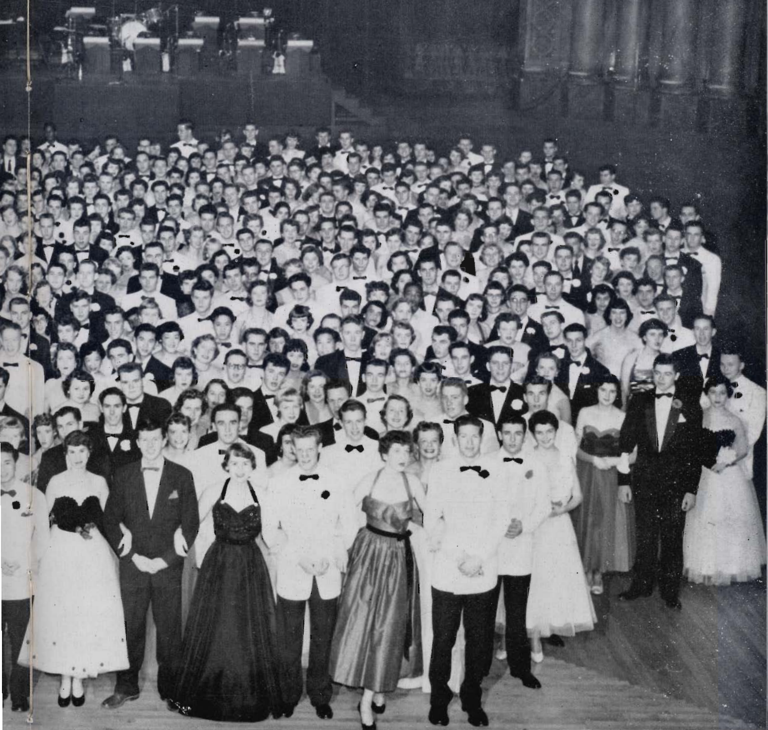
The Fantastic "Fantasia"